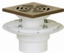
SHOWER DRAIN (square strainer)