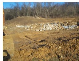
Excavation of Land December 10

Valley Supply is one step closer to a new Central Distribution Center, CDC. We are "ready for winter" with the excavation and excited for Spring to come. These pictures show the current status of the CDC plus pre-excitation pictures. We plan to debut the new CDC in the Fall of 2012.