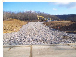
Excavation of Road December 10