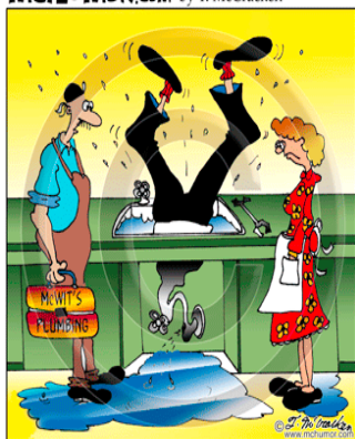
"Your husband started without me, didn't he?"