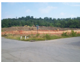
Excavation Begins (from road)