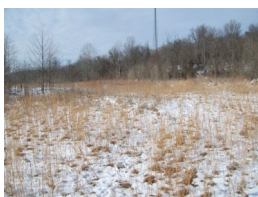
Pre-excitation of Land