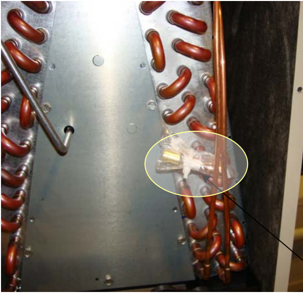
Liquid line Brazing stub (664378)