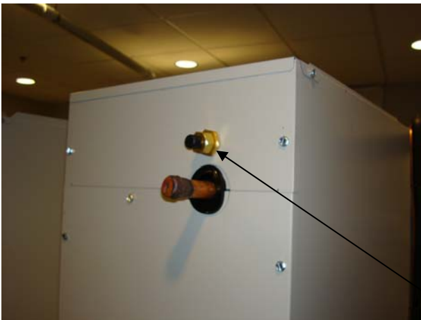
Fitting with black cap and Schrader valve